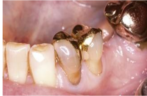
Three-quarter crown which is a partial crown covering all tooth surfaces except the buccal surface.