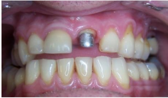
Post crown which replaces the natural crown entirely and retains itself by means of a dowel (post) extended inside the root canal space.